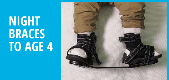
NIGHT BRACES TO AGE 4