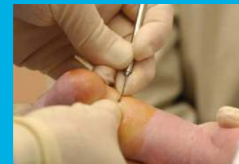
ACHILLES TENDON CLIP